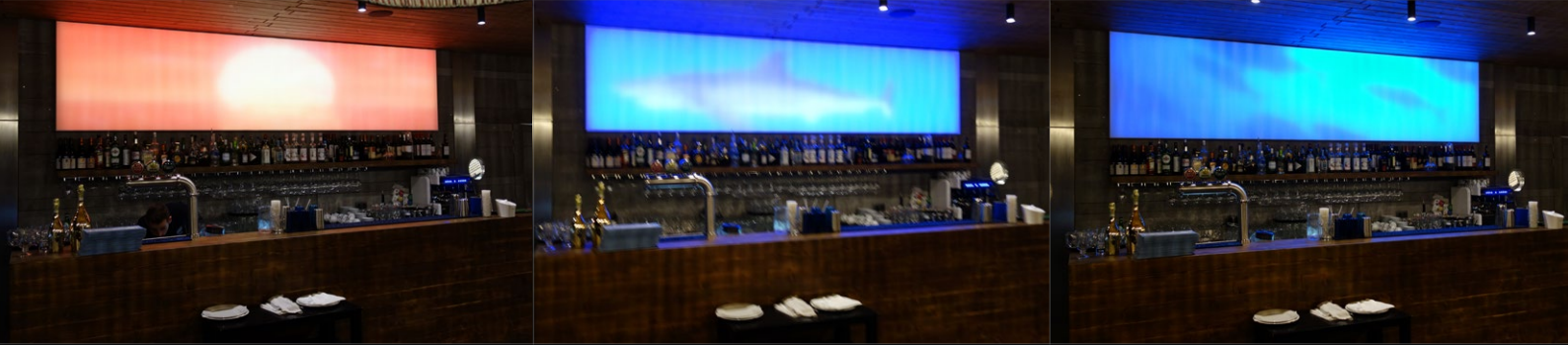
Beautifully simulated sunrise and sunset scenes

The immersive Digital Light Surface delivers animated artwork from digital light. A range of ambient light scenes were designed, including sunrise and sunset, which fit perfectly with the club being purposefully positioned right on the beach. Moving clouds under a blue sky and dolphins swimming in the sea, add cooling effects during the warm season. The animated fire scenes capture the clients imagination and will offer warming effects when the cooler weather arrives.